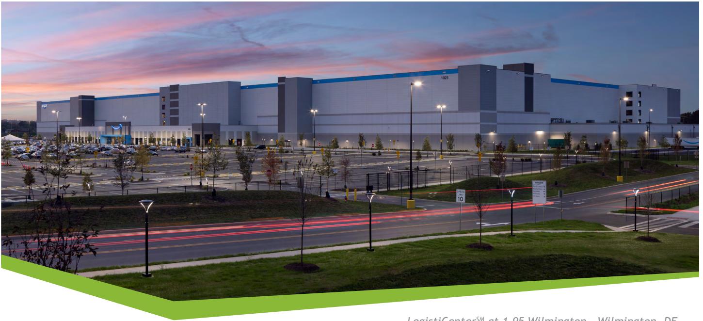
LogistiCenter SM at 1-95 Wilmington - Wilmington, DE +/- 3.8 million SF